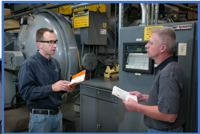
Kinetic's Abar Ipsen 6 bar 36" x 36" x 72" Vacuum Furnace